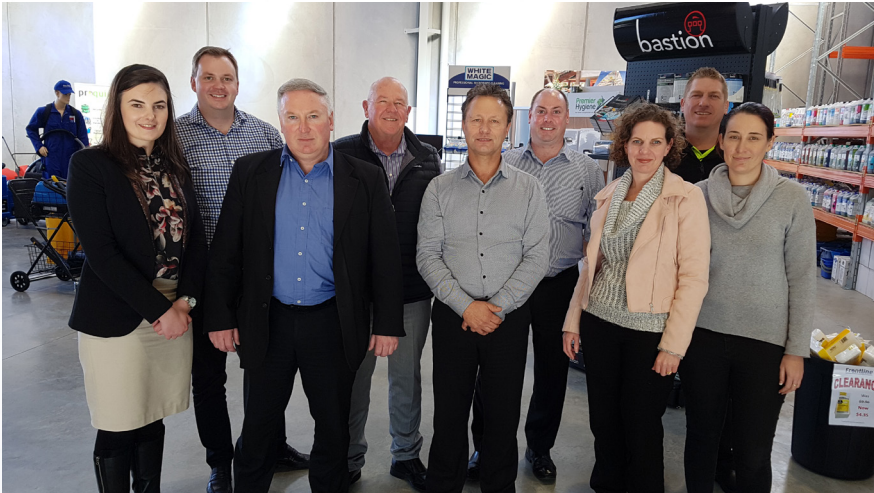
The friendly team dedicated to help you.

A typical day in the office involves humour, coffee, and a constant buzz of activity to keep the wheels turning for our customer's orders and support.