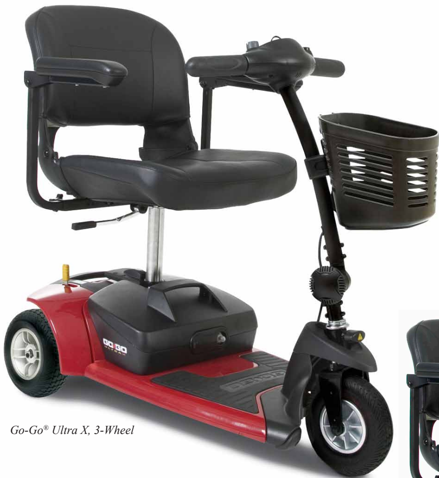
Go-Go ® Ultra X, 3-Wheel

The Go-Go ® Ultra X is loaded with design features like one-hand feather-touch disassembly and a convenient drop-in battery box that makes transport and travel worry free. The Go-Go ® Ultra X delivers these features and more, along with the performance you expect from the first name in travel mobility, making it the ultimate travel scooter value.