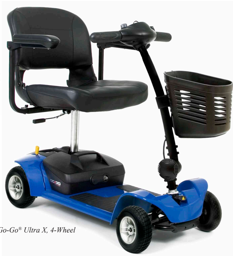
Go-Go ® Ultra X, 4-Wheel